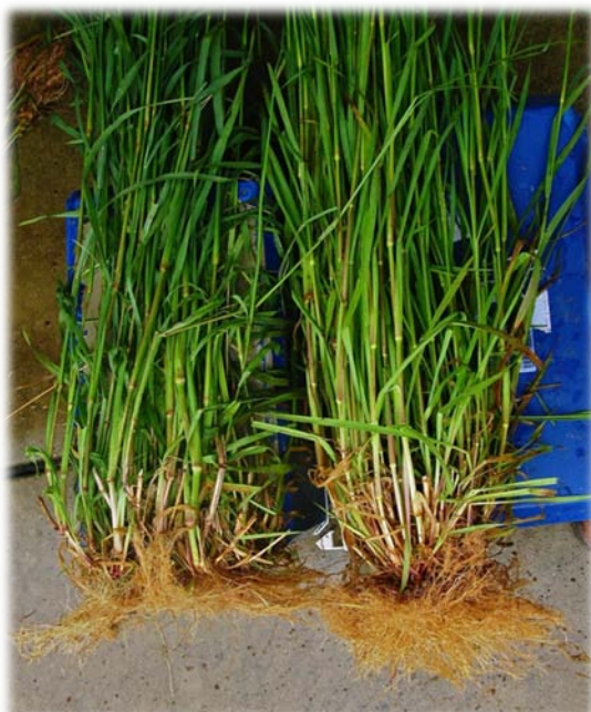
Control Setaria Grass clump with compacted root area (hardpan)

We offer sugarcane and other food/fiber growers an opportunity to build a balanced, thriving crop eco system in which strength, productivity and nutrient density is maximized.